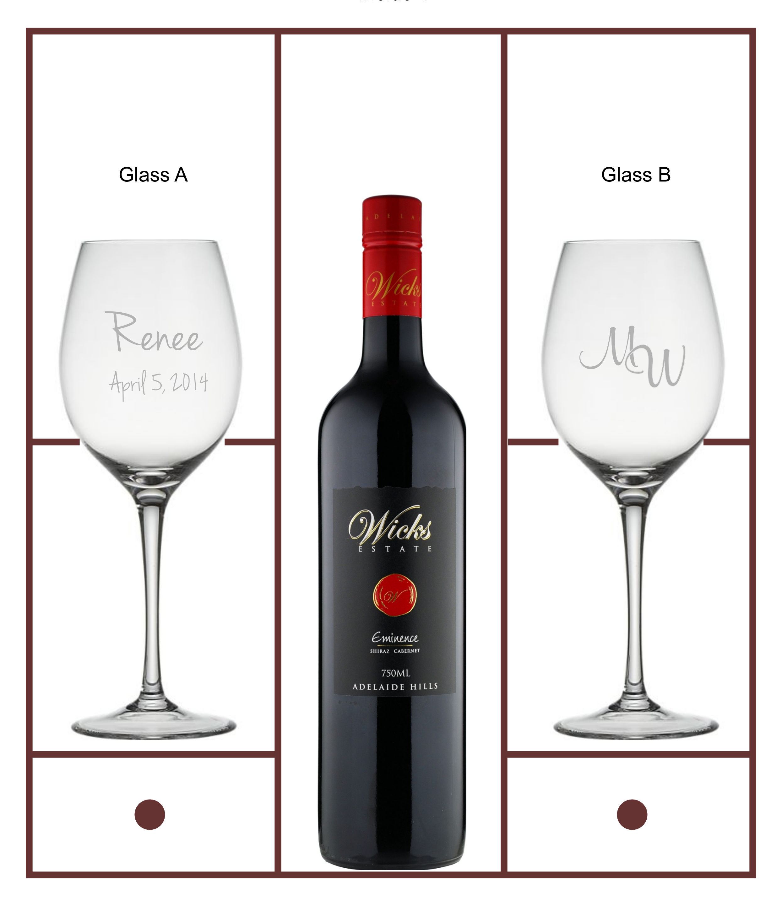
Alcohol is not included