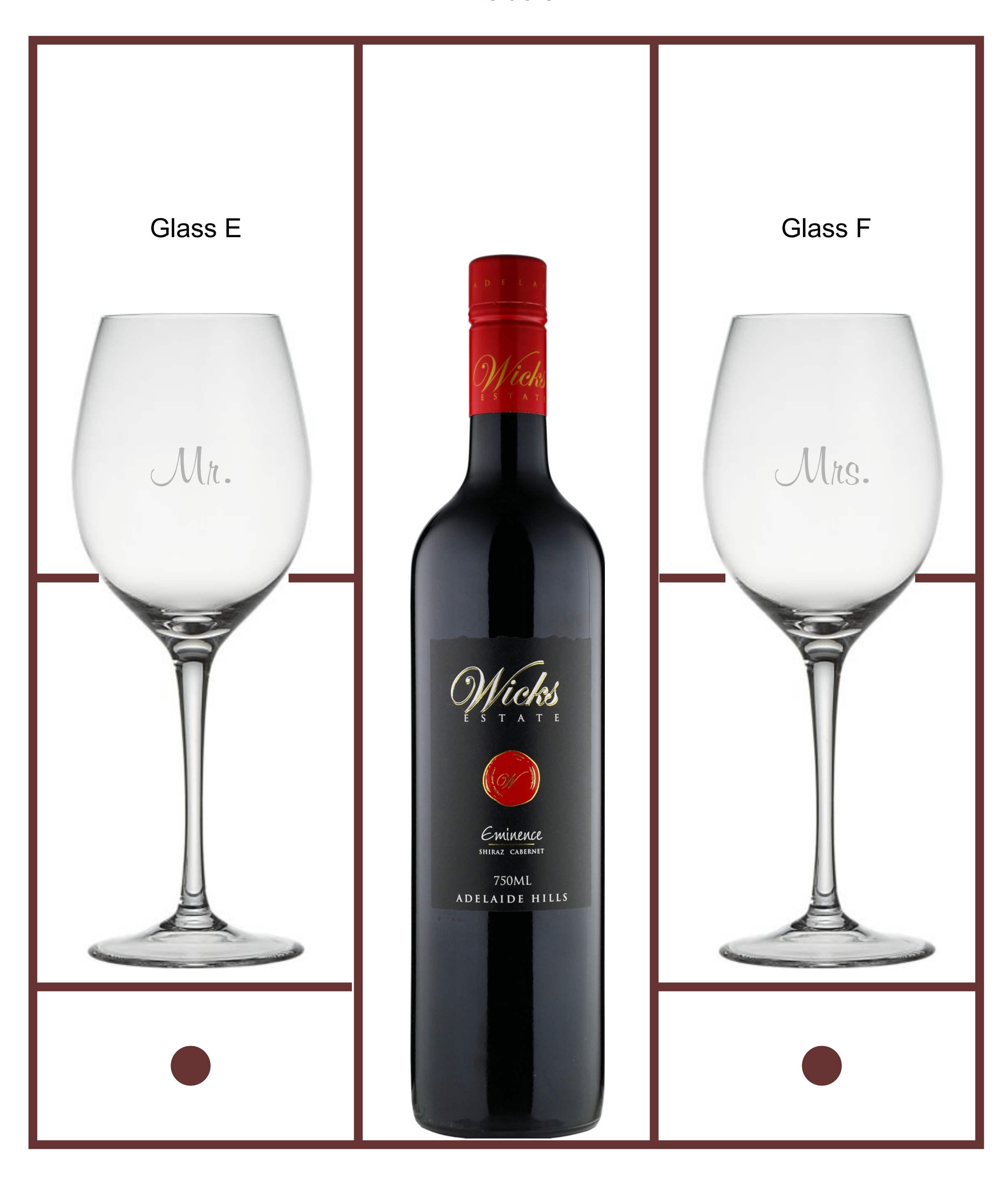
Alcohol is not included