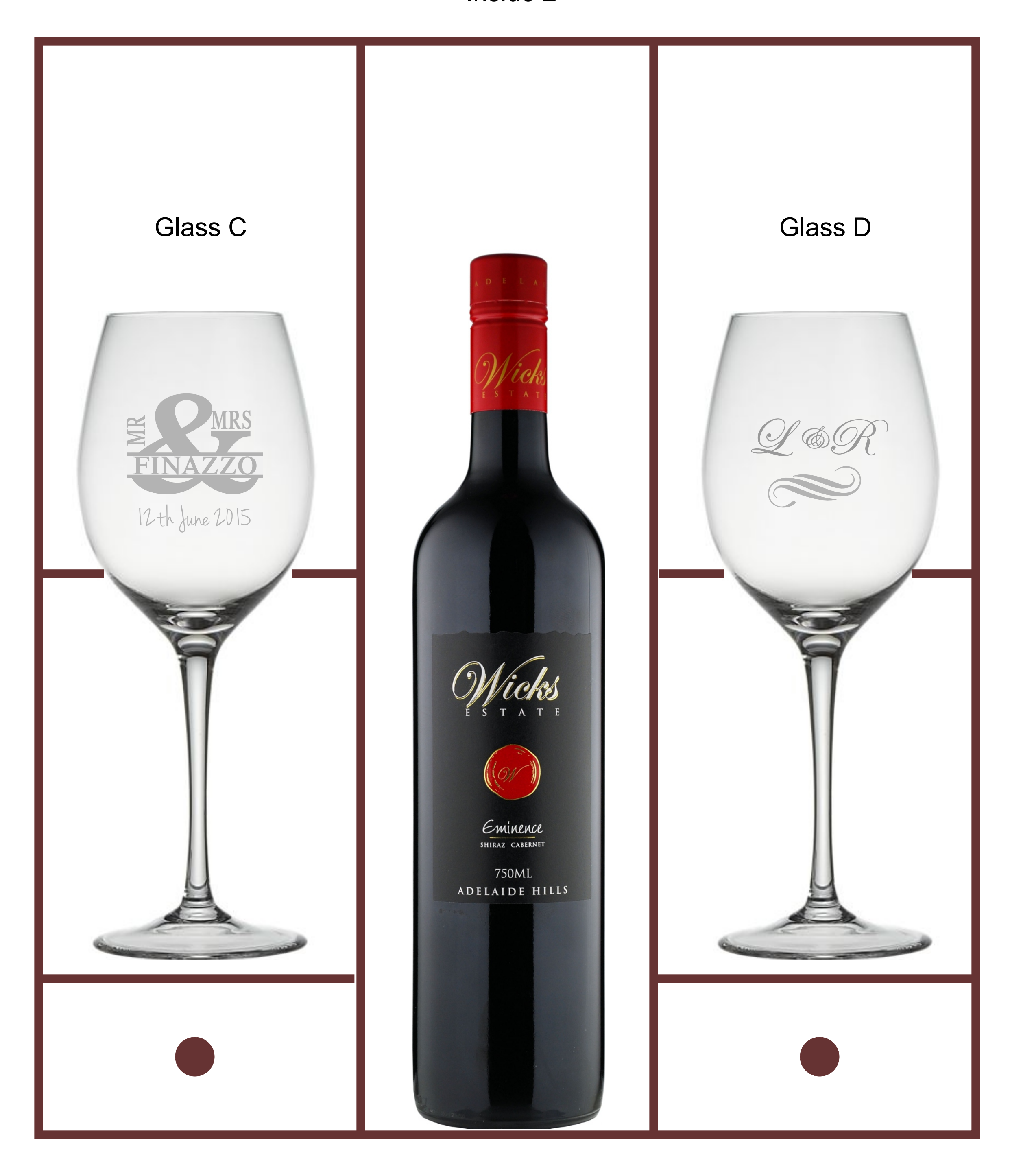
Alcohol is not included